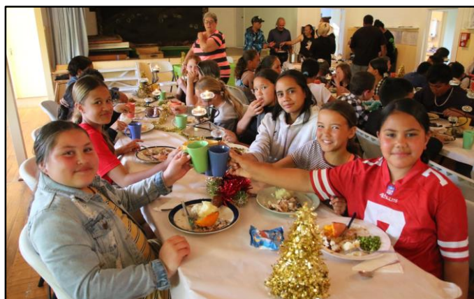
Our departing Year 6 students toast their peers at the Year 6 dinner.